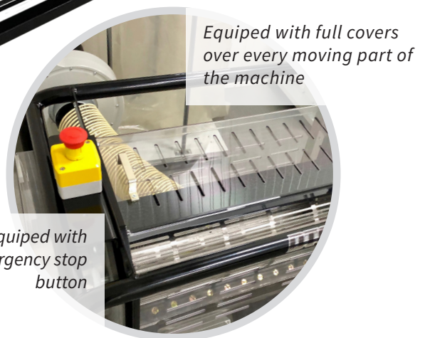
Equipped with full covers over every moving part of the machine

The DTC Pro is designed to run in tandem. Grow your business with confidence by adding 2 trimmers tandem when needed, amping your professional Cannabis production to 40kg per hour with absolutely no increase in labor!